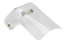
Click to Enlarge Each Face Shield is Shipped with Plastic Wrapping to Prevent Surface Damage During Transport