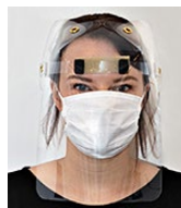
Click to Enlarge Face Shields are Made from Clear Durable PETG Plastic

While not formally submitted for clinical review, this protective face shield was developed to mimic the features and functionality of those used in the medical industry. The simple