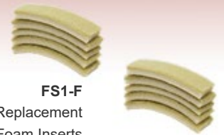
FS1-F 10-Pack of Replacement Latex-Free Foam Inserts