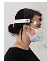
Click to Enlarge One-Size-Fits-All Design Utilizes a 1" Wide Elastic Strap for Secure Fit

The one-size-fits-all design has a 1" wide elastic strap to firmly secure the shield to the user's head. The shield includes a removable foam insert for comfort if wearing for an extended period of time. Additional foam inserts are available for purchase below. For complete design specifications, please see the Face Shield Design tab above.